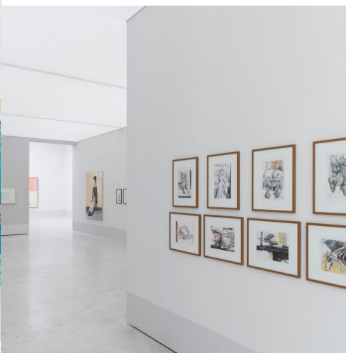
Museion, exhibition view, 2018.