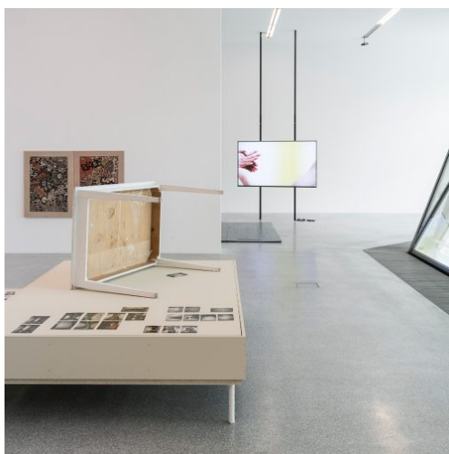
“Doing Deculturalization”, exhibition view. Museion, 2019.

— Sonia Khurana, Logic of Birds .