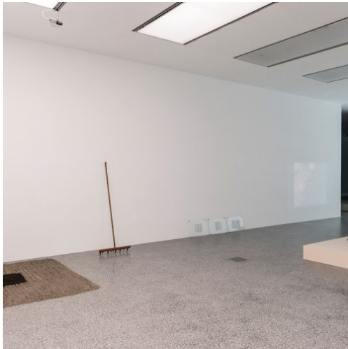
“Doing Deculturalization”, exhibition view. Museion, 2019.