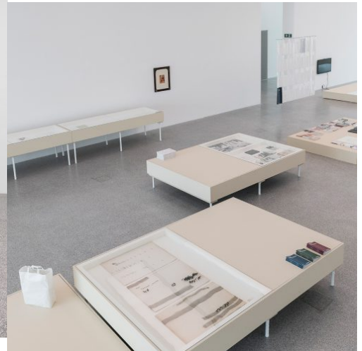
“Doing Deculturalization”, exhibition view. Museion, 2019.