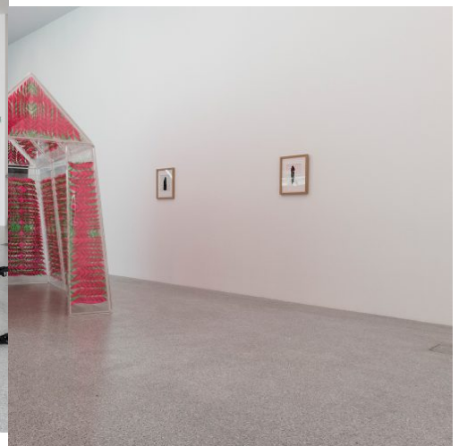
“Doing Deculturalization”, exhibition view. Museion,