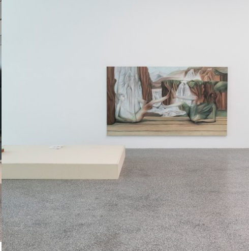
“Doing Deculturalization”, exhibition view. Museion, 2019.