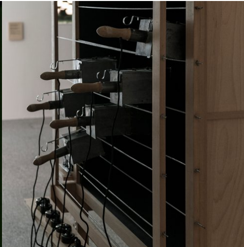
Ludwig Hirschfeld-Mack, Lichtspiel-Apparat, dettaglio/Detail/detail, Museion 2019.