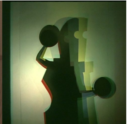
Ludwig Hirschfeld-Mack, Farbenlichtspiele, reconstruction 2000. A film by Corinne Schweizer, Peter Böhm