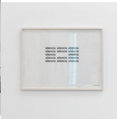
Eugen Gomringer, Silencio, 1954.