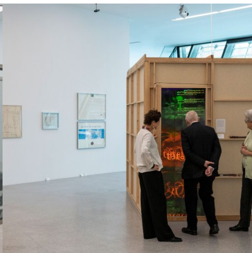
Dick Higgins, Poema d'aria/Luftsymphonie, 1973/1995, Museion – Collezione Archivio di Nuova Scrittura.