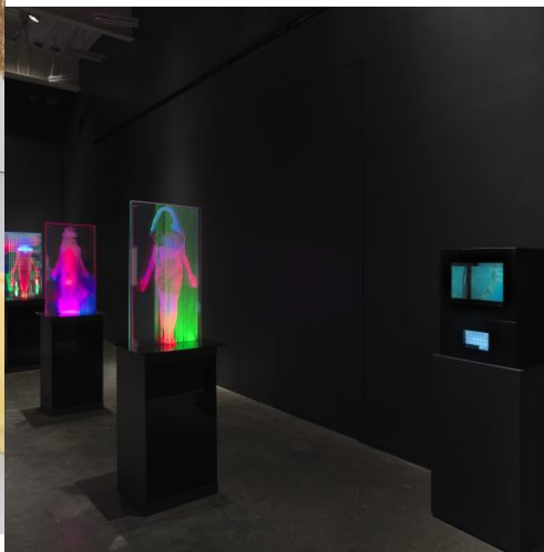
"Lynn Hershman Leeson: Twisted ," 2021, exhibition view: New Museum, New York, Twisted Gravity , 2021. Etched plastic, LED lights, Aqua Pulse system, water, wood, cables, wire, and metal hardware.