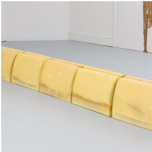
Ian Law, The wait is over. Exposed waiting room chair backs with picked home-dried flower shadows , 44 x 310 x 44 cm, 2015. Installation view, Ian Law: you're adjusting , Rodeo, London, 2015.

The public programme for the exhibition will include talks, meetings, film screenings and a series of online and offline events organised as part of Museion Art Club, with the support of Museion Private Founders .